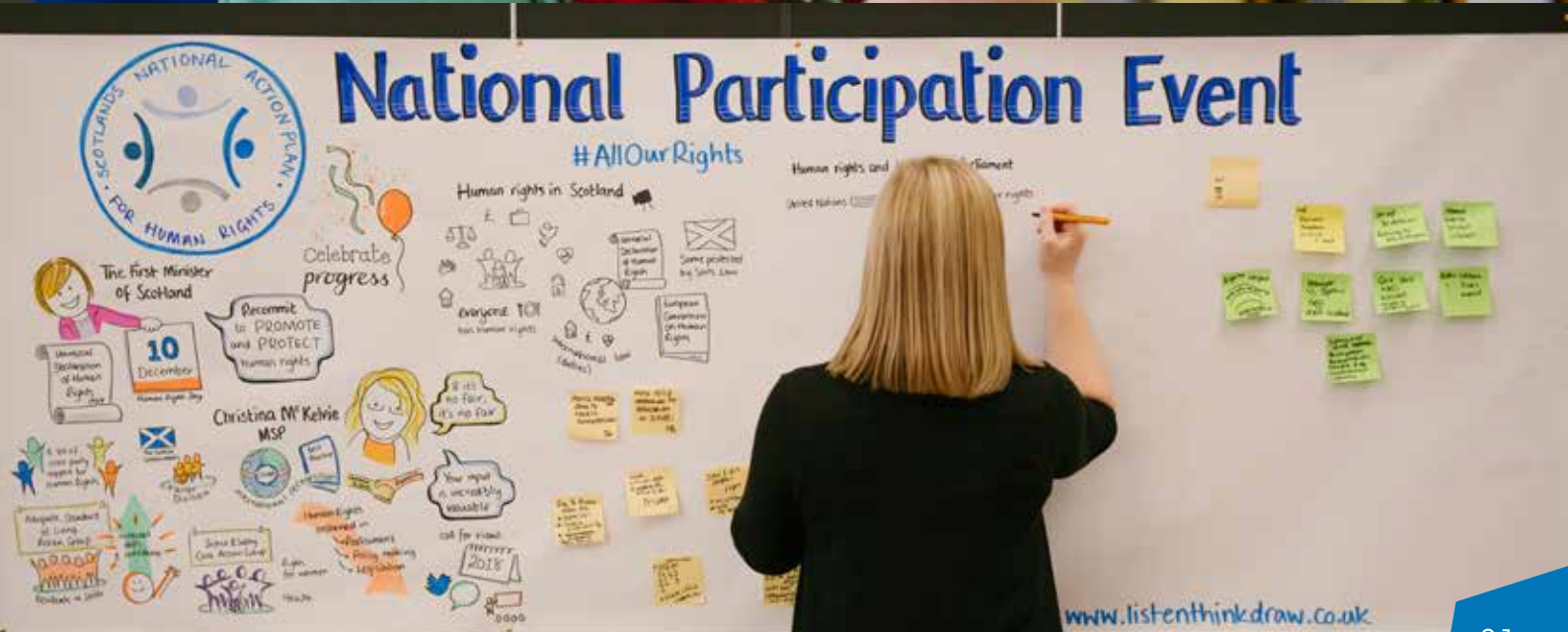
National Participation Event to inform Scotland's National Action Plan for Human Rights, December 2017