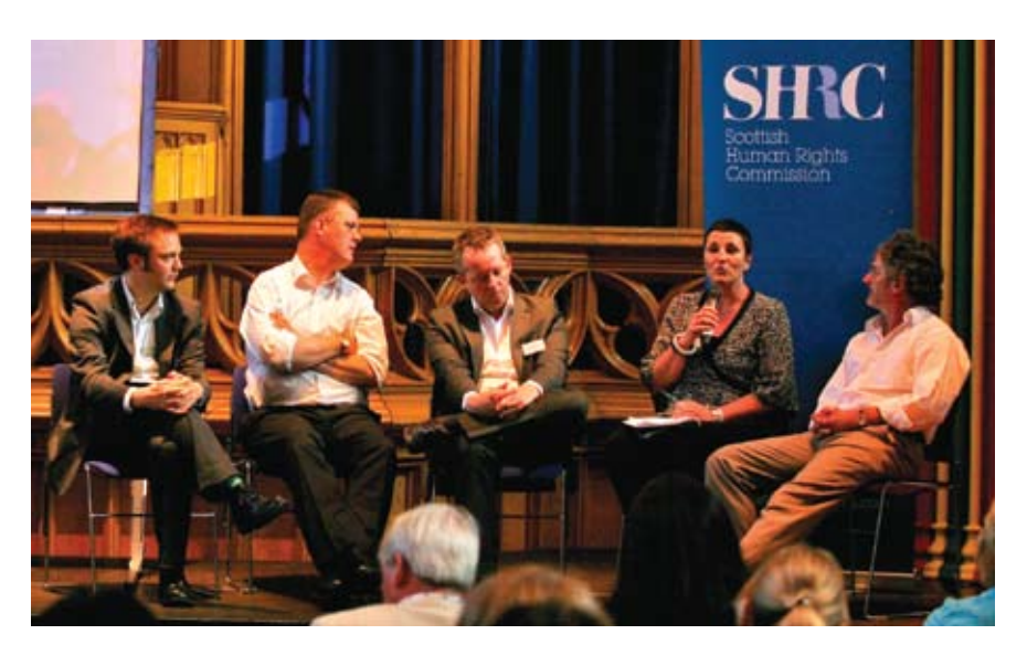
Inaugural conference of the four Commissions of the UK and Ireland, June 2009