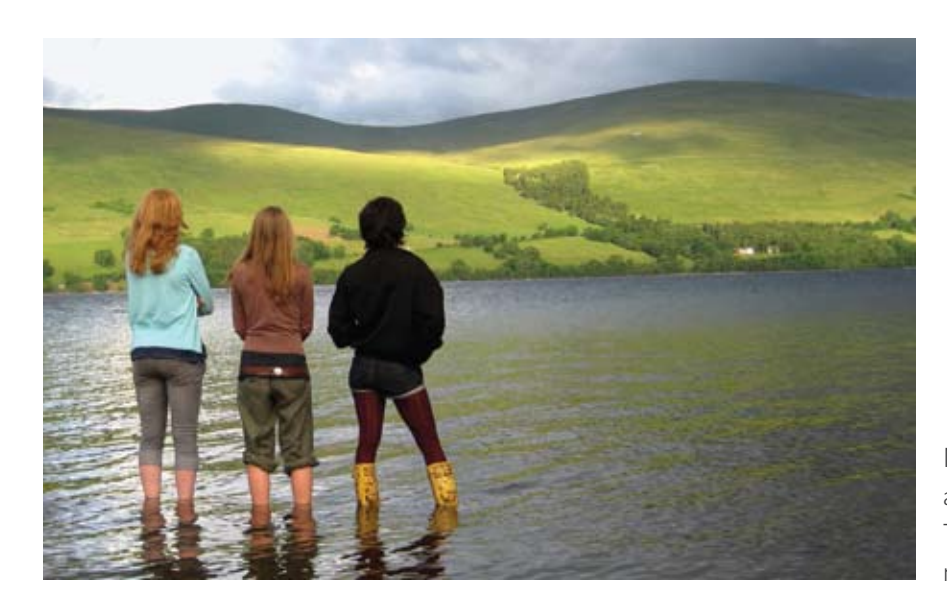
NTS volunteers at the Ben Lawers Trailblazer camp, near Killin

We will also respond to emerging issues where in our view Scotland has a significant contribution to make to global efforts. We are currently representing the European group of national human rights institutions (NHRIs) to help develop strategies for all institutions around the world on two such issues: human rights and climate change and human rights and business.