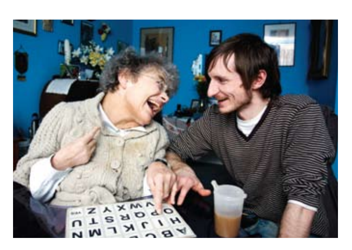
Visiting at home with the Ecas Befriending Project

The promotion and protection of human dignity in care — this emerged very clearly, consistently and strongly from our national consultation as an area needing attention. We will work with regulatory bodies, care providers and care users to advance a human rights-based approach (as discussed below) to care in Scotland. We are already developing an evaluation of the experience, outcomes and benefits of a human rights-based approach pilot scheme which has run for several years in The State Hospital at Carstairs.